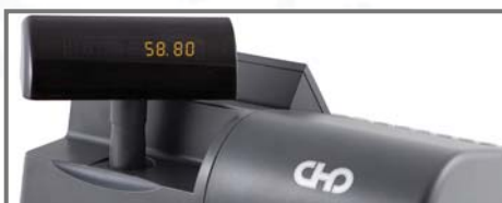
CLEAR LED CUSTOMER DISPLAY