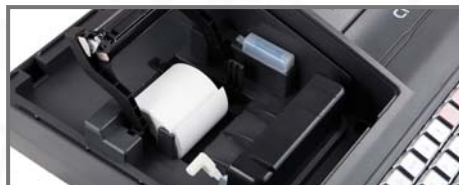
EASY PAPER LOAD