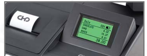
SCROLLABLE LCD DISPLAY